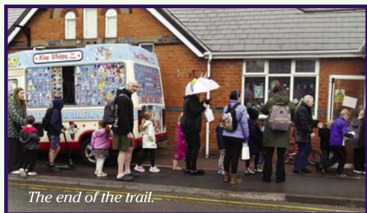
The end of the trail.

The trail ended at the Village Hall, where children met the Easter Bunny, played games, and enjoyed a free hot dog and fries. Everyone went home with big smiles and an Easter treat.