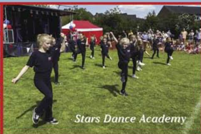
Stars Dance Academy