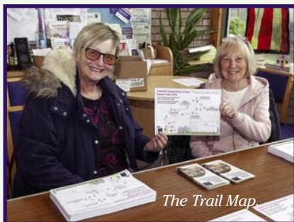
The Trail Map.

DESPITE the wet weather, Catshill was buzzing this Good Friday as record numbers turned out for the 2025 Easter Trail.