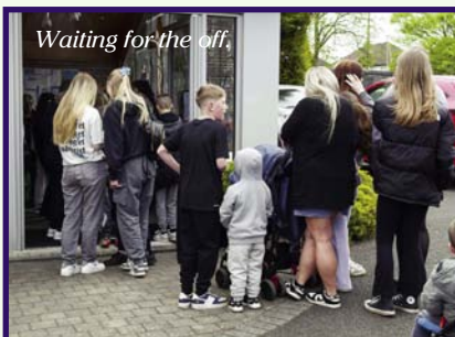
Waiting for the off.

and Easter-themed activities at every stop.