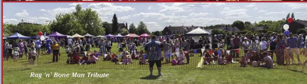
Rag 'n' Bone Man Tribute