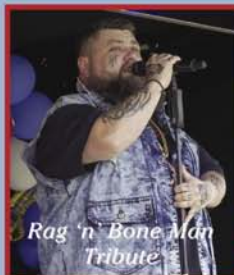
Rag 'n' Bone Man Tribute