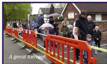
A great turnout.

Families followed the trail through each of the village churches, enjoying crafts, games,