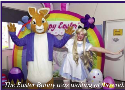
The Easter Bunny was waiting at the end.