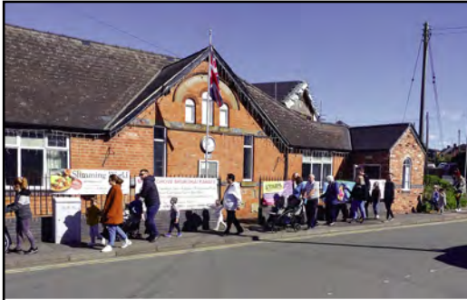
Crowds form a line to start the trail.

The trail started at the village hall on what was a very sunny day. This led to a huge turnout of excited youngsters and adults alike, queuing to get their trail maps, then enjoying a lovely walk following the trail looking for clues around the village.