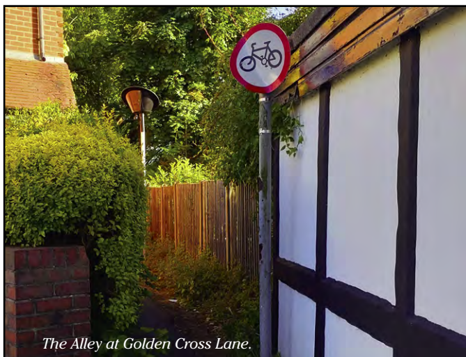
The Alley at Golden Cross Lane.

THE parish council have purchased and paid for the fitting of three solar lights to a well-used footpath in the parish. Running between Oak Road and Golden Cross Lane, the path was poorly lit when dark, and the new lights will encourage more people to use it. The three new lights (on poles kindly provided by Bromsgrove District Council) are the same design as those that we had installed in the alley between Barley Mow Lane and Golden Cross Lane.