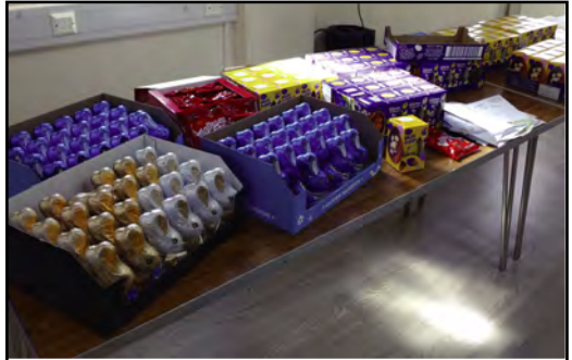
Easter Eggs to be given out.

On returning to the village hall each child was presented with an Easter egg by either Peter Rabbit or the Easter Bunny.