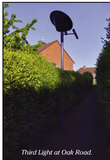
Third Light at Oak Road.