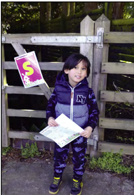
One of the Trail points.

Well done and thank you to everyone involved in this successful event.