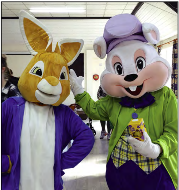
Peter Rabbit & The Easter Bunny.