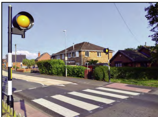
New Zebra Crossing by the Co-Op.

A few years ago a member of the public attended one of our meetings and asked if we could get a Zebra Crossing installed in Barley Mow Lane. Whilst it is not within the remit of the parish council to install Zebra Crossings, we fully supported the idea and were able to get Worcestershire County Council (Highways) to install a crossing by the Co-Op. Other locations have also been considered for Zebra Crossings within the parish, but there are strict legal and technical restrictions that WCC have to apply, meaning suggested locations are not always feasible.