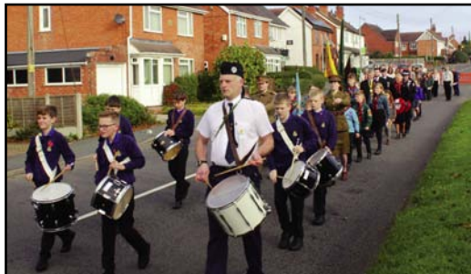
Boys' Brigagde lead the parade.