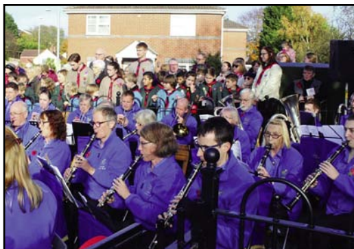
The Blackwell Concert Band.