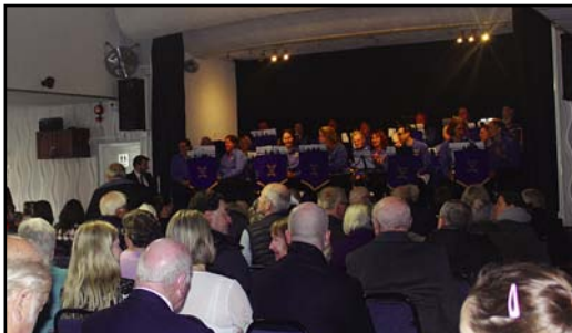
Service inside Catshill Club.

SUNDAY 13th November 2022 was Remembrance Sunday and we were able to return to the now traditional format of a service in the Catshill Club (opposite the War Memorial) conducted by the various Catshill churches at 10:00am, followed by a short parade from the Middle School to the War Memorial, where the annual act of remembrance was held from 10:50, until just after 11:00am.