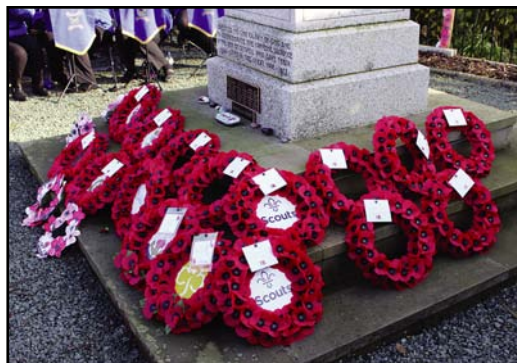
Wreaths around the memorial.