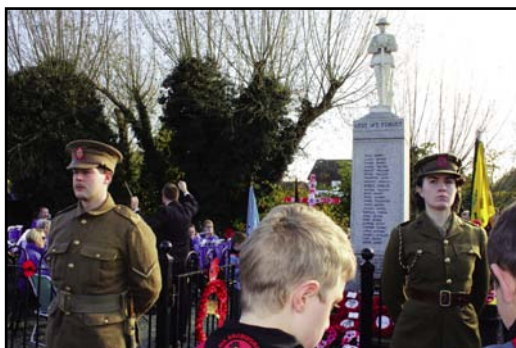
Service at the Memorial.