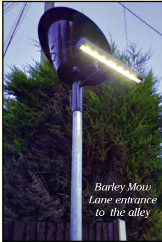
Barley Mow Lane entrance to the alley

Light, has net zero carbon emissions, illuminates 16m of pathway and operates on a body temperature motion sensor to conserve energy and increase efficiency. The lights charge in all weather types, from bright sunny days to gloomy cloudy ones, making it a reliable source of light and in turn making dark streets and alleys safer for all local residents. The lights were installed by Reddilight a family-run business based in