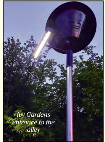
Ivy Gardens entrance to the alley