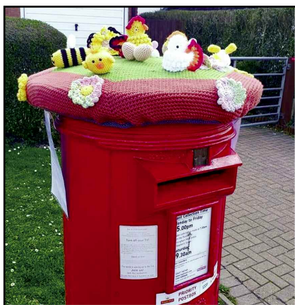
Post Box Topper at the top of Milton Road

HAVE you noticed the colourful Post Box Toppers that appear around Catshill? If you haven't then please look out for them, as they are sure to put a smile on your face!