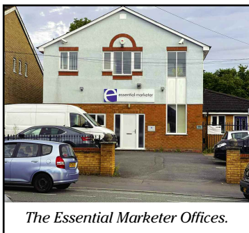
The Essential Marketer Offices.