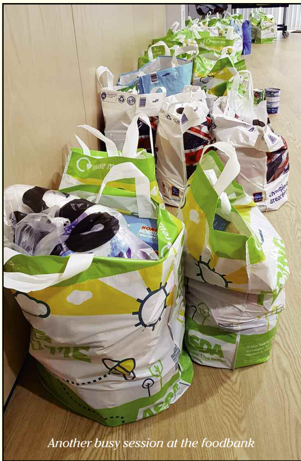
Another busy session at the foodbank

For help, or donations, the foodbank can be contacted in strictest confidence on 07542 102649, 07754 567800 or foodbank@catshillbaptist.org.uk .