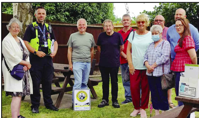
Catshill Neighbourhood Watch Group Meeting

NEIGHBOURHOOD Watch brings neighbours together with a joint purpose of increasing neighbourliness, community spirit and reducing opportunities for crime by creating a stronger community. By sharing and acting upon crime prevention advice, you can play an important role in helping to reduce crime or fear of crime in your area.