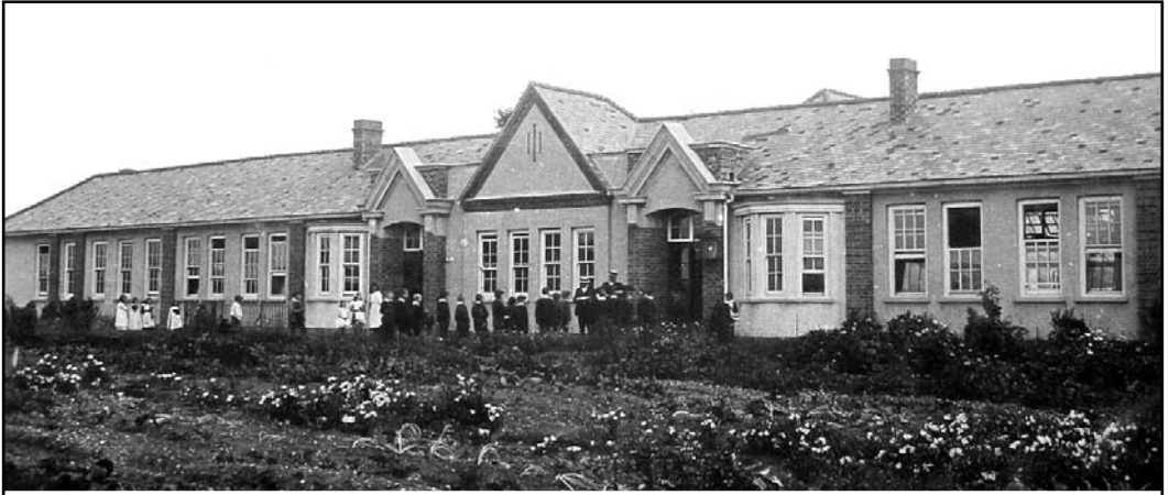
Catshill First School c1916

THIS edition of From Our Past shows a building that many of us will know well. It's Catshill First School.