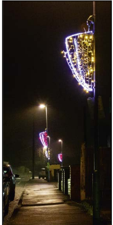
The lights in Golden Cross Lane.