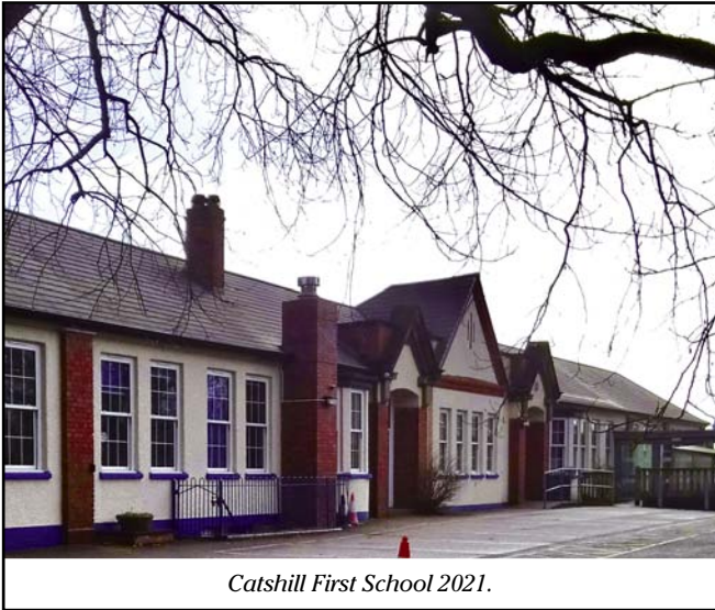
Catshill First School 2021.

This photograph was probably taken round 1916, and it clearly shows the use of the separate Boy's and Girl's entrances, which was a common feature in most schools at the time. It also shows the schoolmasters wearing boaters, the boys in their smart uniforms and the girls wearing Victorian style smocks.