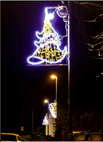
The lights in Golden Cross Lane.