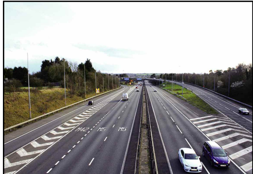
M5 Southbound 2020 also from Rocky Lane Bridge.

FOR this edition, I have found something which I hope you will find of interest from my own family archives. The M5 motorway from Junction 4 Lydiate Ash southwards towards Worcester, was opened on 20th July 1962. Interestingly the M5 North of Junction 4, towards Birmingham was constructed in sections several years later from 1967 to 1970!