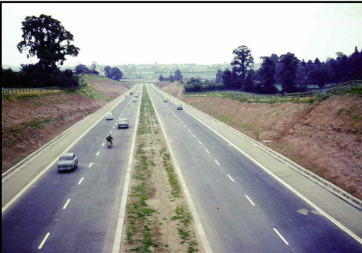
M5 South Bound c1963 from Rocky Lane Bridge.