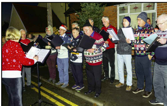
The Methodist Church Men's Choir were in good voice.