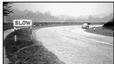
Before the M5. The old A38 at Spring Pools, north of Lydiate Ash.