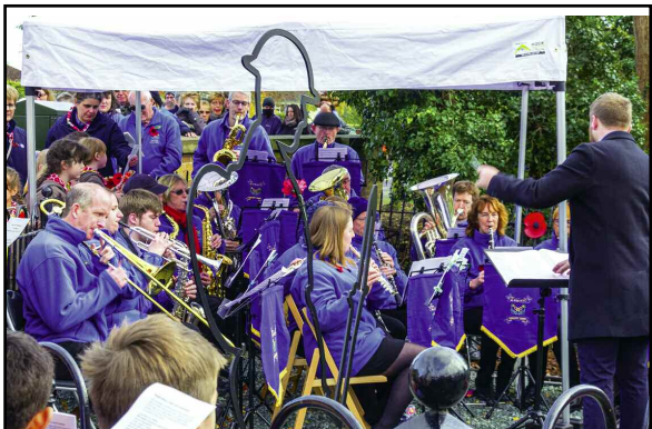
Blackwell Band, who played the music.