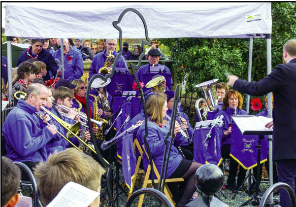
Blackwell Band, who played the music.

supplied the refreshments in the Social Club afterwards.