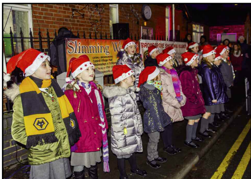
The carols sung by Fairfield First School Choir delighted the crowd.