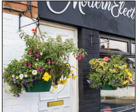
Some of the hanging baskets in the the village.