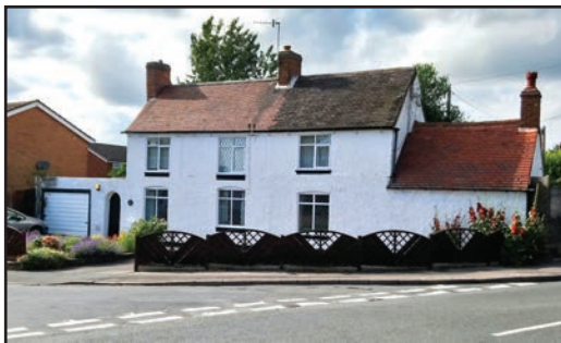
Formerly 17, now 23 Church Road today

Many of you will remember that for many years this property was a “corner shop”, positioned at the junction of Church Road and Wildmoor Lane.