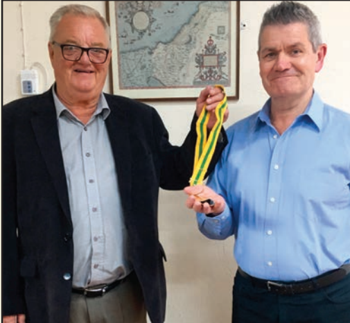
Handover of Chair