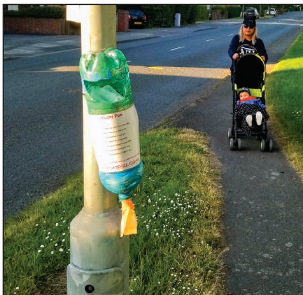
The dog poo bag dispenser on Golden Cross Lane.