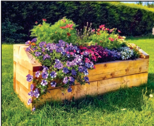
One of the many plant tubs decorating the area.