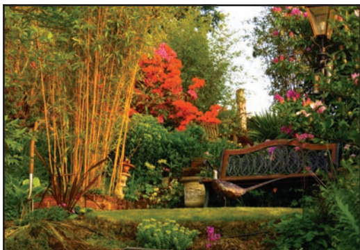
Part of the Marlbrook Gardens.