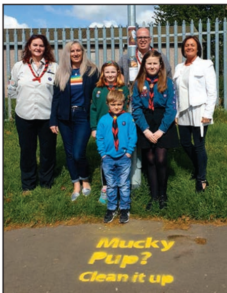
6th Bromsgrove Scouts Mucky Pup Campaign.

HAVE you noticed all the extra dog poo bag dispensers that have appeared around the village? They are made from old plastic bottles, that have been attached to a number of lampposts.