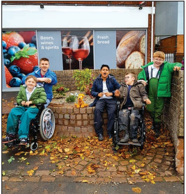
The team with the newly planted bed outside Spar.

Some residents are helping to water the planters. if you wish to become involved and willing to water one near you, please contact the Parish Clerk.