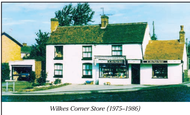
Wilkes Corner Store (1975–1986)

Finally, please do let me know if you have an interesting old photograph that you would like to share in a future edition of the news magazine.