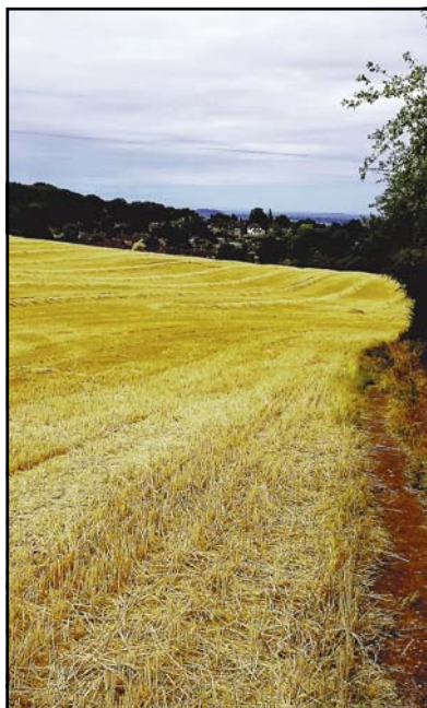
Cereal crops and a wonderful view.