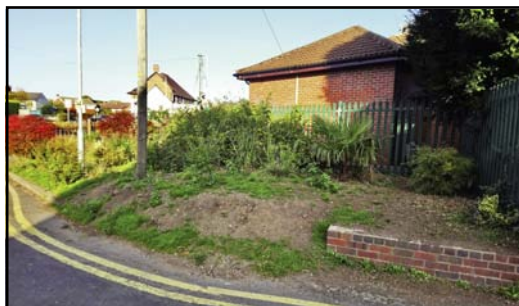
Gravel boards will be installed here to prevent soil erosion

We hope you agree that these measures further improve our parish.