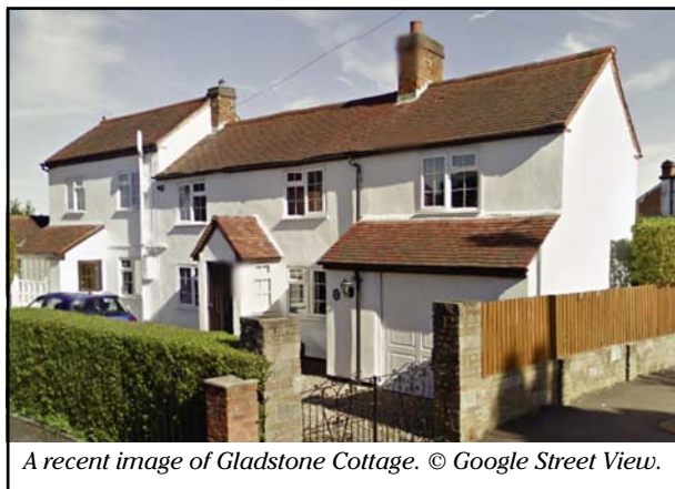
A recent image of Gladstone Cottage.

It was taken from the footpath, and clearly shows a nail shop attached to the