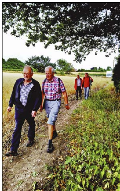
Councillors walk the Woodrow Lane footpath.

ONE evening at the end of July, some of the parish councillors and other interested parties met together to walk some of the local footpaths. This has now become an regular event, with the aim of familiarising councillors with the local rights of way, and monitoring the condition of the paths, in terms of walkability, signage and way marking.