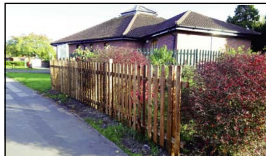
The new fence that will go round the garden