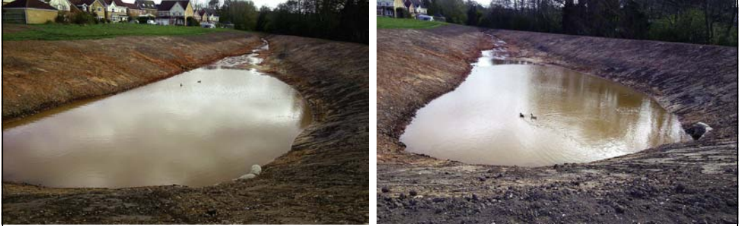
New flood alleviation balancing ponds on the Horse Course.

NOW that the ground works for the Green Lane flood alleviation scheme have been completed the Parish Council is keen to enhance the natural flora and fauna of the site.