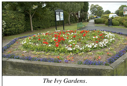
The Ivy Gardens.

The parish council is a democratic, grass-roots based, publicly funded body. The members of the parish council represent the community, help to deliver services to meet local needs and strive to improve the community's quality of life. We look at issues relating to our local environment such as neighbourhood planning, community events, bus shelters, street lighting, highways matters, traffic concerns – in fact most of the range of topics that affect all those of us living in Catshill and North Marlbrook.