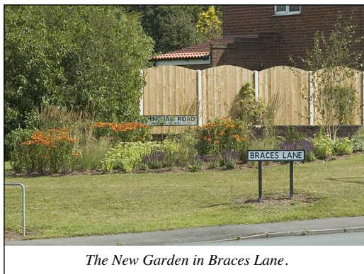
The New Garden in Braces Lane.

“ Marlbrook gardeners ” marked the teardrop shape out, and awaited P.R. Grounds Maintenance (our contracted gardeners) to cut the shape out, remove the turf, add top soil and do all of the planting.