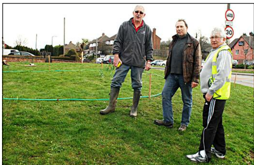
Volunteers mark out the garden.