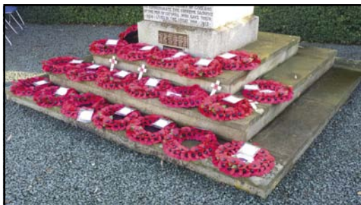
90 years later.