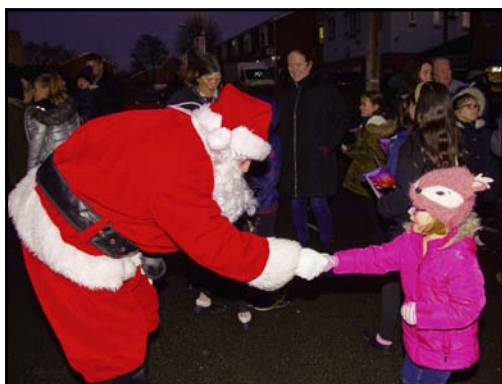
Santa meets a fan.

CATSHILL'S first Christmas Light Switch On was attended by over 200 people on Saturday 25th November last year.