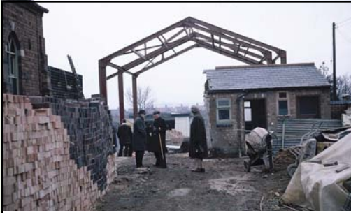
The 'New' Catshill Methodist Church under construction in 1968.