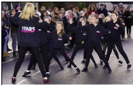
Stars Dance Academy.

CATSHILL'S first Christmas Light Switch On was attended by over 200 people on Saturday 25th November last year.