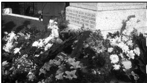
The War Memorial in 1927.