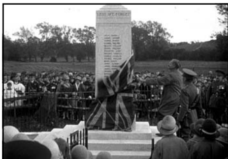
The Catshill War Memorial being unveiled in 1927

WHEN large crowds gathered for the annual act of remembrance on Sunday 12th November last year, it marked 90 years of remembrance at this location.