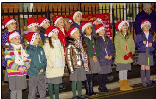
Fairfield First School Choir.