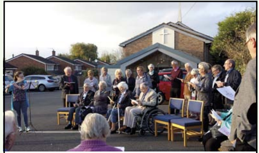
Catshill Methodist Church starting their 50th anniversary celebrations.

THE current Catshill Methodist Church building will have been open for 50 years in October 2018.