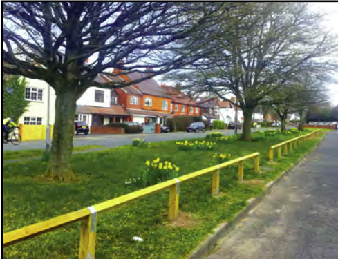
The new fence in Golden Cross Lane.