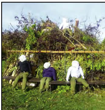
The Bonfire takes shape.

DESPITE the clash with Halloween this year, as it was held on 31st October 2015, the Bonfire and Firework event held on Catshill Meadow continues to be a huge success. The Parish Council are proud to be involved in the organisation of this community event and would like to Thank all those involved in the process, particularly the Scouts as they are instrumental in the smooth running and provision of food and drink for the evening. Due to the high volume of people we would like to advise residents who attend this year to take care when exiting the field following reports of people spilling into the road at the previous event. Obviously the safety of all is extremely important at events such as this and we thank you for your co-operation.