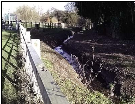
The brook's new route at the back of Ash Drive

Completion of this flood storage area is the last in a series of measures being taken to reduce the fearful impact of heavy rainfall,