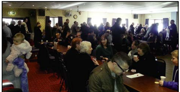
The crowd in the club after the event

ONCE again thank you to everyone who attended the Remembrance Sunday inter-denominational service held at Catshill Club and the act of remembrance at the War Memorial across the road on Sunday 9th November 2014. The attendance at this event continues to grow and much thanks goes to all who help with this important commemoration each year.