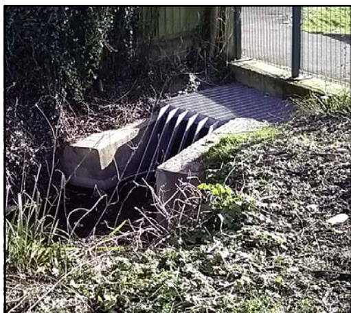
Marl Brook trash screen

The site is likely to remain quite muddy until the area is re-seeded which may take some time to establish. Eventually in the next planting season trees and shrubs will be planted around the site.