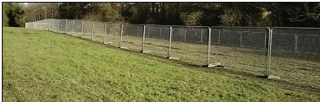
The site of the balancing pool at Sedgefield Walk