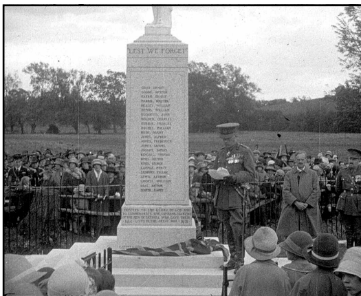
The War Memorial Unveiling and Dedication. October 2nd 1927.